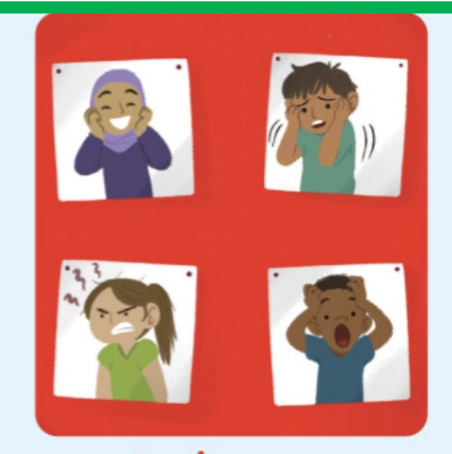
Red Zone Overjoyed/Elated Panicked - Angry - Terrified

Copyright © 2021 Think Social Publishing, Inc. All rights reserved. Adapted from The Zones of Regulation 2-Storybook Set Available at www.socialthinking.com