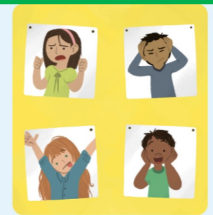
Yellow Zone Worried - Frustrated Silly - Excited