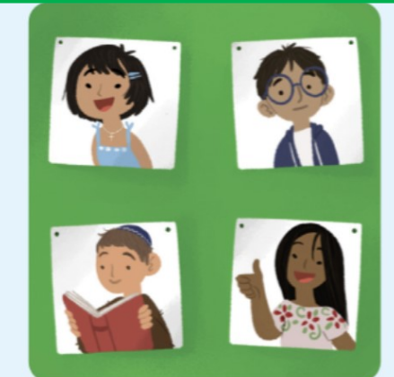
Green Zone Happy - Focused Calm - Proud